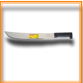
Model # 145

Handle: Injected Polypropylene - Blade: Polished