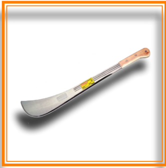
Model # 32

Handle: Wood, Riveted - Blade: Polished with grooves