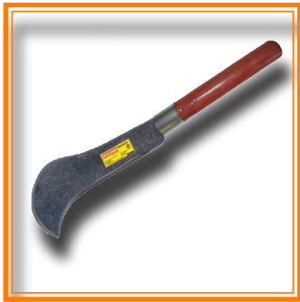
Model # 951