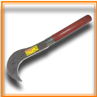
Model # 952