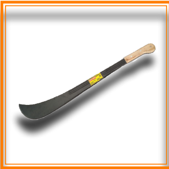
Model # 33

Handle: Wood, Riveted - Blade: Black Varnished with grooves