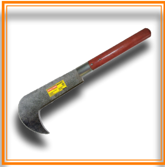
Model # 940