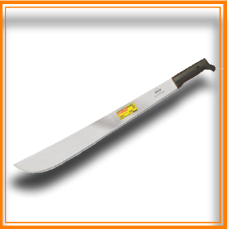
Model # 127

Handle: Injected Polypropylene - Blade: Polished