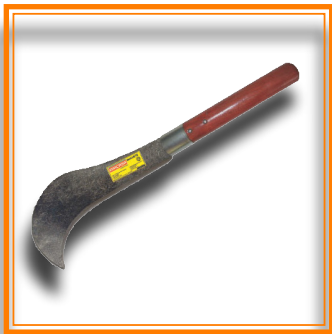
Model # 953